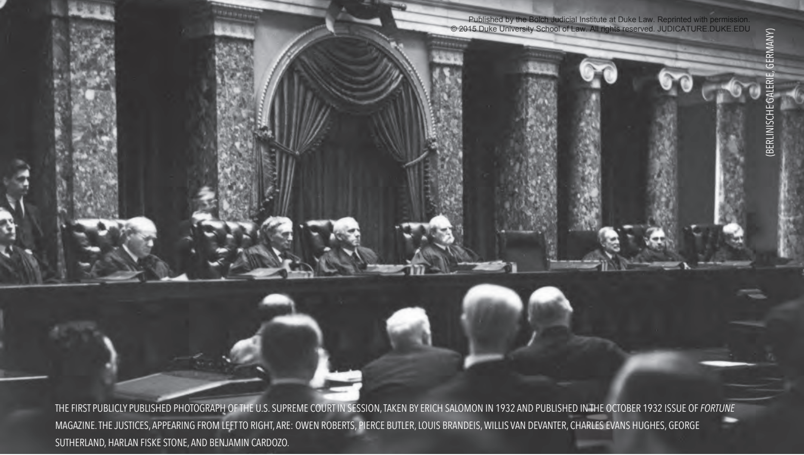
THE FIRST PUBLICLY PUBLISHED PHOTOGRAPH OF THE U.S. SUPREME COURT IN SESSION, TAKEN BY ERICH SALOMON IN 1932 AND PUBLISHED IN THE OCTOBER 1932 ISSUE OF FORTUNE MAGAZINE. THE JUSTICES, APPEARING FROM LEFT TO RIGHT, ARE: OWEN ROBERTS, PIERCE BUTLER, LOUIS BRANDEIS, WILLIS VAN DEVANTER, CHARLES EVANS HUGHES, GEORGE SUTHERLAND, HARLAN FISKE STONE, AND BENJAMIN CARDOZO.

change their behavior out of fear that their comments will be taken out of context. 23